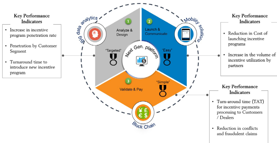
Fig1: “Design thinking approach” for incentive planning towards customer service innovation

In order to decode these success factors and formulate an effective incentive program, Infosys developed a “design thinking” based unified framework, which is elaborated below.