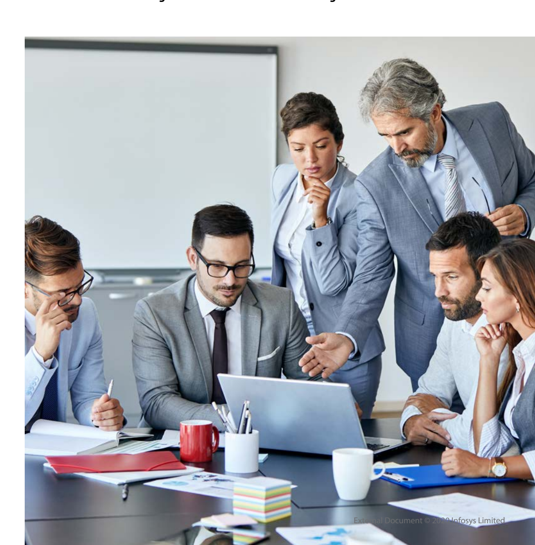
Infosys Cognitive Automation Studio uses a unique 'Microbot' approach where bots are stitched together to form Workerbots and Digital Workers