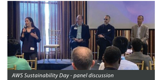
AWS Sustainability Day - panel discussion

Infosys teamed up with the AWS Sustainability Day, a premier invite-only day of inspirations, thought leadership, and panel discussions designed for leaders who have a vested interest in sustainability, IT professionals, and builders across all industries who are committed to reducing costs while protecting the environment.