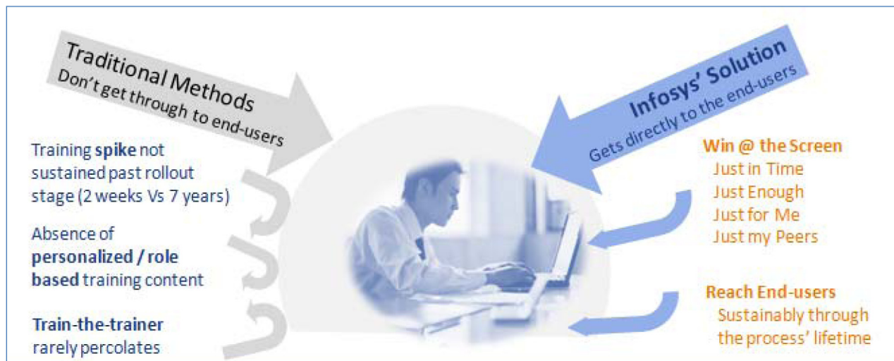
Infosys' approach of learning at the screen will help users to win at the screen.

Many organizations still believe that training a small fraction of initial users will, perhaps through osmosis, transfer the learning to all the end-users over the process life-time. Far from it- this approach leaves users confused, misinformed and frustrated. A formal approach towards sustained end-user adoption and learning is the only way to realize business benefits from process changes and upgrades.