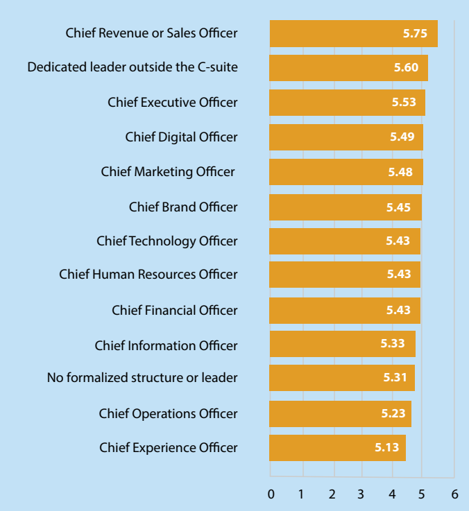
Figure 2: Relative digital commerce performance by leader

The Infosys Digital Commerce Radar 2023 study also revealed that chief revenue officers (CROs) or chief sales officers (CSOs) deliver better results than their technology counterparts when leading digital commerce programs.