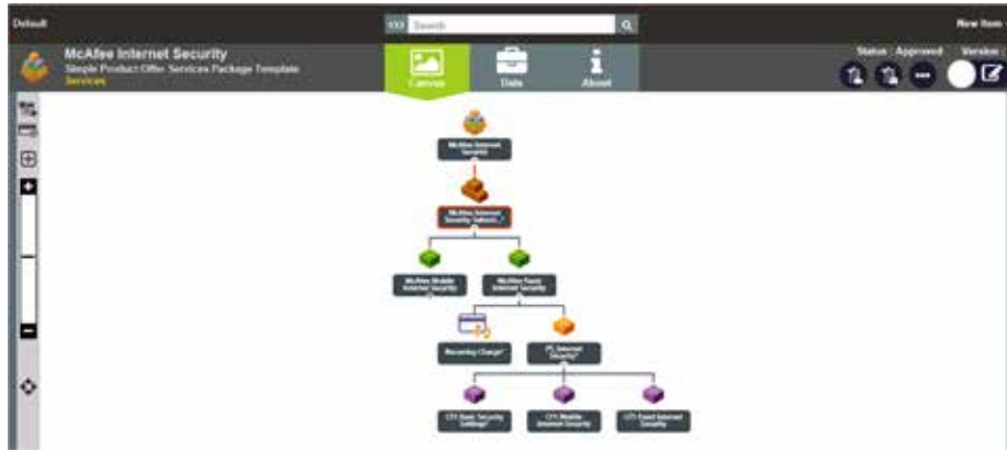
Figure 2: Full product structure of McAfee Internet Security product in the catalog

McAfee Internet Security product. The product consists of two subscription options – McAfee Mobile Internet Security and McAfee Fixed Internet Security component products. The following sequence of events take place: