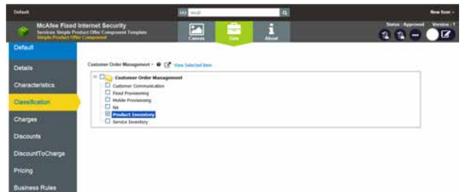
Figure 3: Customer order management classification defined on McAfee Fixed Internet Security product offer

5. The product catalog then sends the response back to the order