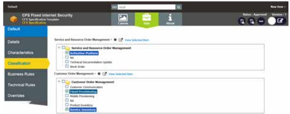
Figure 4: Customer order management and service and resource order management classifications defined on CFS Fixed Internet Security