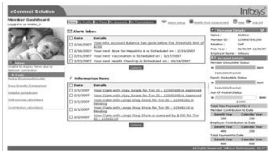
(Sample screenshot of a Consumer dashboard)

A dynamic portal that creates a simple logic for supporting your product strategy by coordinating myriad functionalities and data necessary to inform new consumers. It is also scalable to accommodate future requirements.