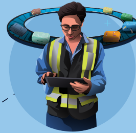
Bag Runner Dispatcher