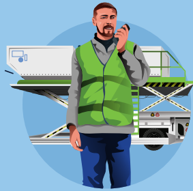
Global ULD Tracer