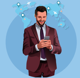
Integrated NetZero Platform