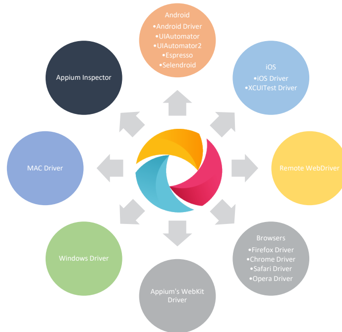
Figure 1: Appium 2.0 Driver Architecture

Driver architecture: Appium 2.0 allows for independent maintenance, installation, upgrade, and uninstallation of drivers without impacting the core Appium versions. This marks a significant improvement from the constraints of the Appium 1.X series, where driver installation and upgrades were closely tied to the core framework. The decoupled architecture of Appium 2.0 enables upgrades without the need for new drivers or plugins, streamlining the framework and making for a lighter and loosely coupled system. This improves test execution performance, eliminates conflicts between different driver versions, and mitigates the risk of test breakage by upgrading each driver separately. Figure 1 represents the driver architecture of Appium 2.0.