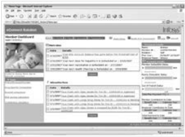
Sample screen shot of a Consumer Dashboard

A dynamic portal that creates a simple logic for supporting your product strategy by coordinating the myriad functionalities and data necessary to inform new consumers. It is also scalable to accommodate future requirements.