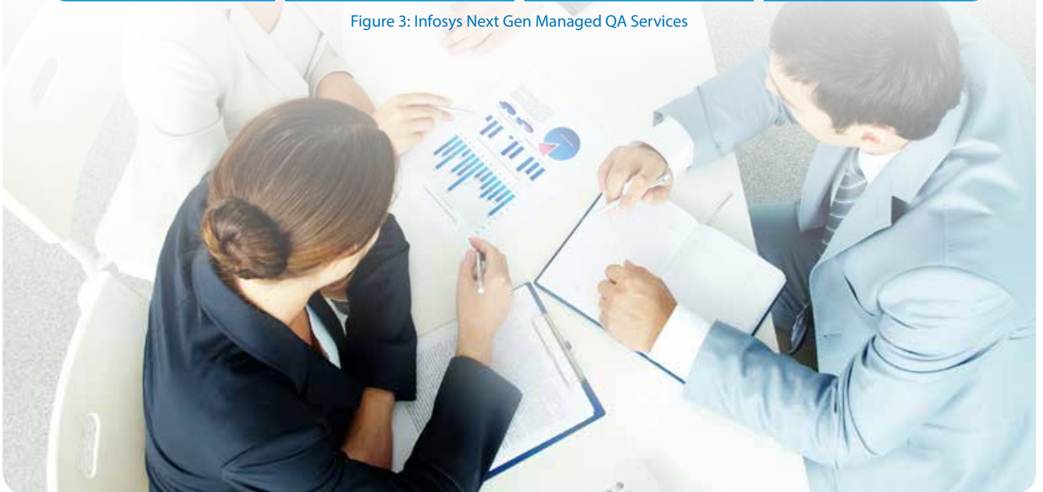
Figure 3: Infosys Next Gen Managed QA Services