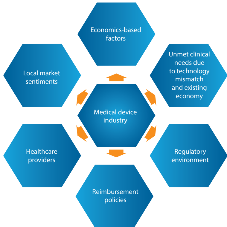
Fig 1. A mapping of the major factors that affect the Indian medical device industry

A World Bank estimation reveals that India typically spends only 1% of its overall GDP on public health (accounting for recurrent and capital spending from government budgets, external borrowings, grants and social health insurance funds) [1].