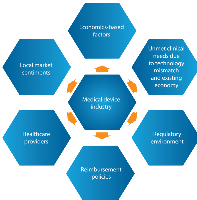
Fig 1. A mapping of the major factors that affect the Indian medical device industry

A World Bank estimation reveals that India typically spends only 1% of its overall GDP on public health (accounting for recurrent and capital spending from government budgets, external borrowings, grants and social health insurance funds) [1].