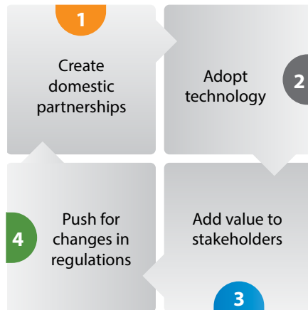
Fig 2. Recommended steps to capitalize on the Indian market

Despite India's unique market dynamics, local sentiments and challenges, there are strategies that device manufacturers can utilize to capture and maximize on the market share.