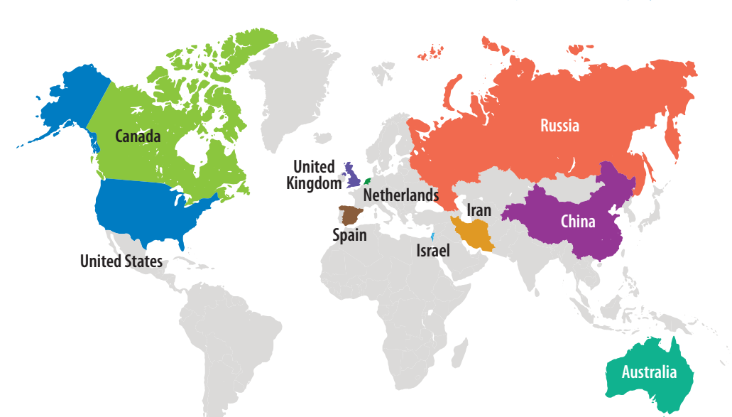
Figure 2. Top 10 countries that intend to pursue multiple national objectives using cyber means

5G will create better connectivity by delivering greater speed and capacity and providing low latency. That will lead to the proliferation of endpoints, as individuals and companies become more connected. By 2025, 2.7 billion devices will be connected to 5G.<sup>5</sup> As a result, attackers will target that growing number of endpoints and connectivity vulnerabilities.