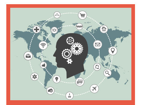
Decision Makers Understand relevant factors, impact of interventions and uncertainties

In the corporate world, the impact of decisions prompted by an AI system can be far-reaching. Unearthing the factors that might have contributed to the decision and determining