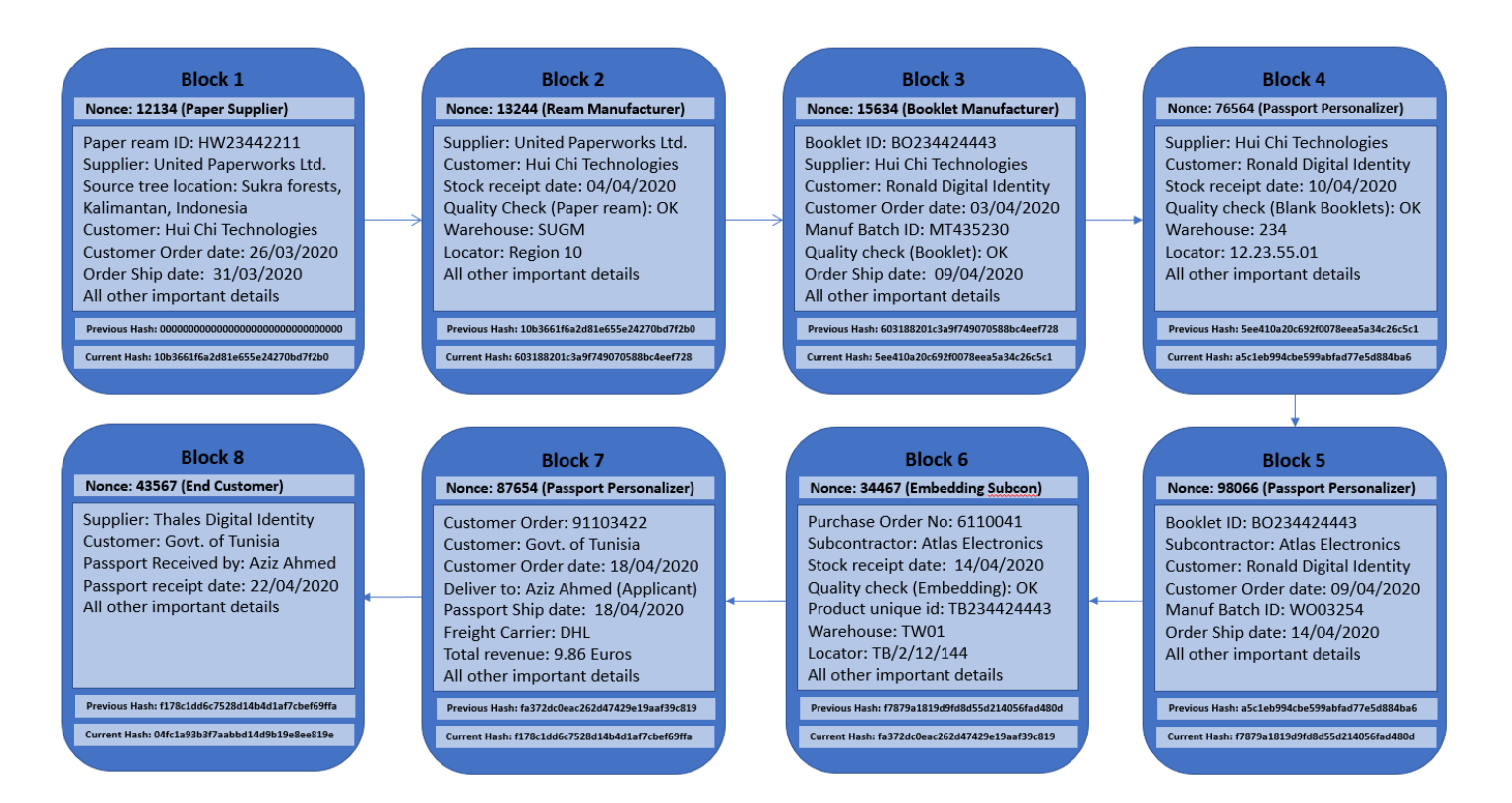
Figure 2: Blockchain representation of a passport supply chain

The below figure illustrates how these set of transactions will be created in a blockchain.