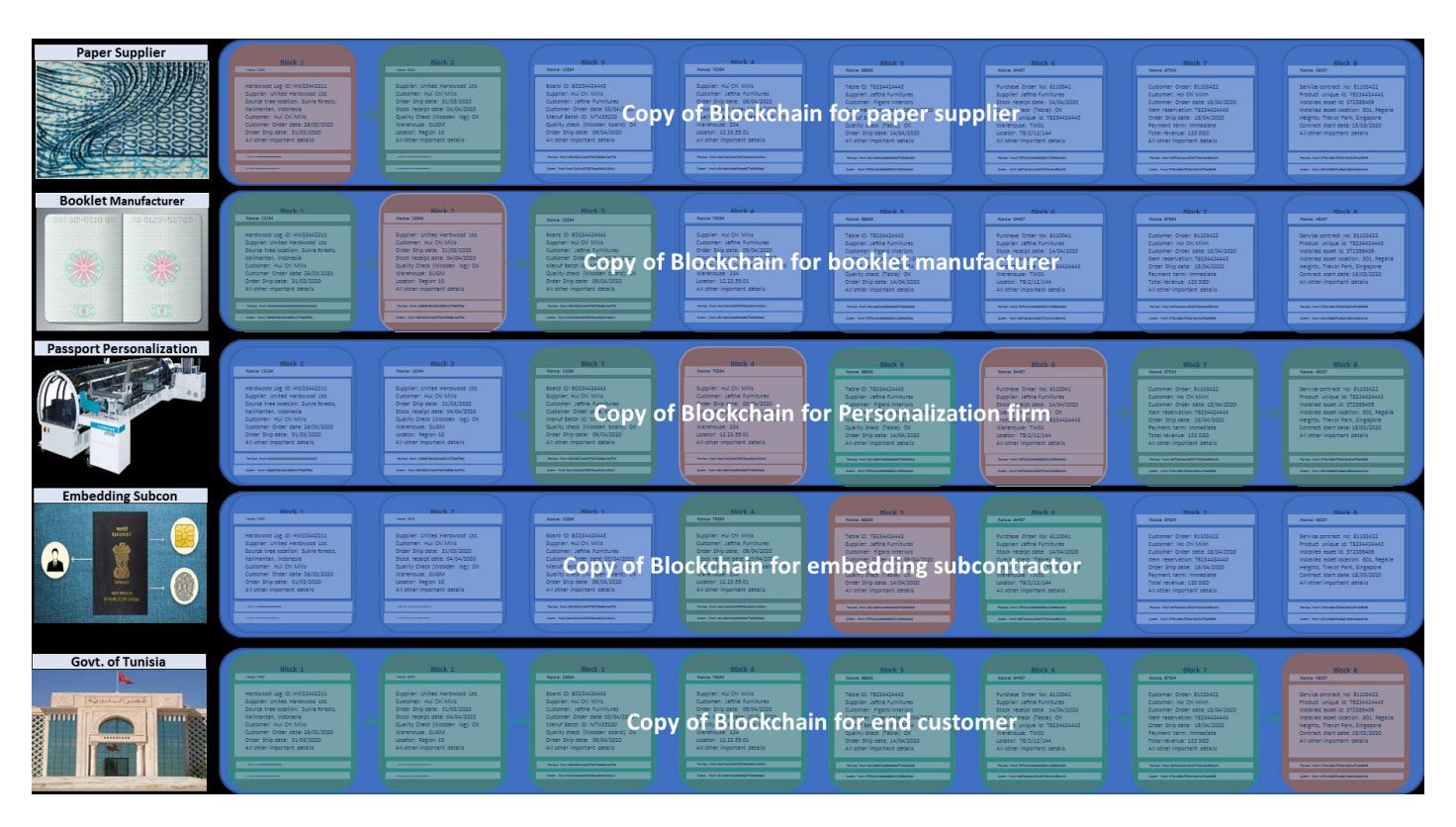
Figure 3: Illustration of network nodes and distributed ledger system for various stakeholders. Blue blocks represent non-accessible information, green blocks signify read access while red blocks indicate read and write access. Each set of nodes correspond to the detailed nodes illustrated in Figure 2.

blockchain mentioning which of the earlier blocks needs correction and the specific correction required. The immutability feature in a blockchain is maintained based by the hash code of each block. Hash codes are the encrypted alphanumeric codes which contain not only the data of the current block but also the hash code of the previous block. Hence, if someone makes a change in any data of one of the blocks, the hash codes of all preceding blocks are updated and this alerts the stakeholders about the data security breach and the blockchain is restored to normal again.