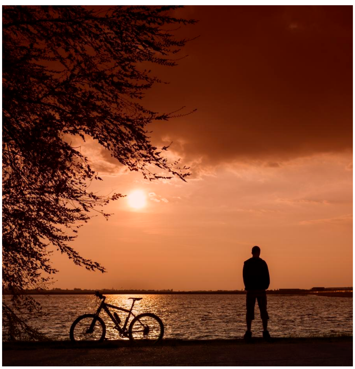
External Document © 2020 Infosys Limited

Her bike shop is their lifeline, and it's been providing the family with a relatively steady income for several years now. Until COVID-19 hit, that is.