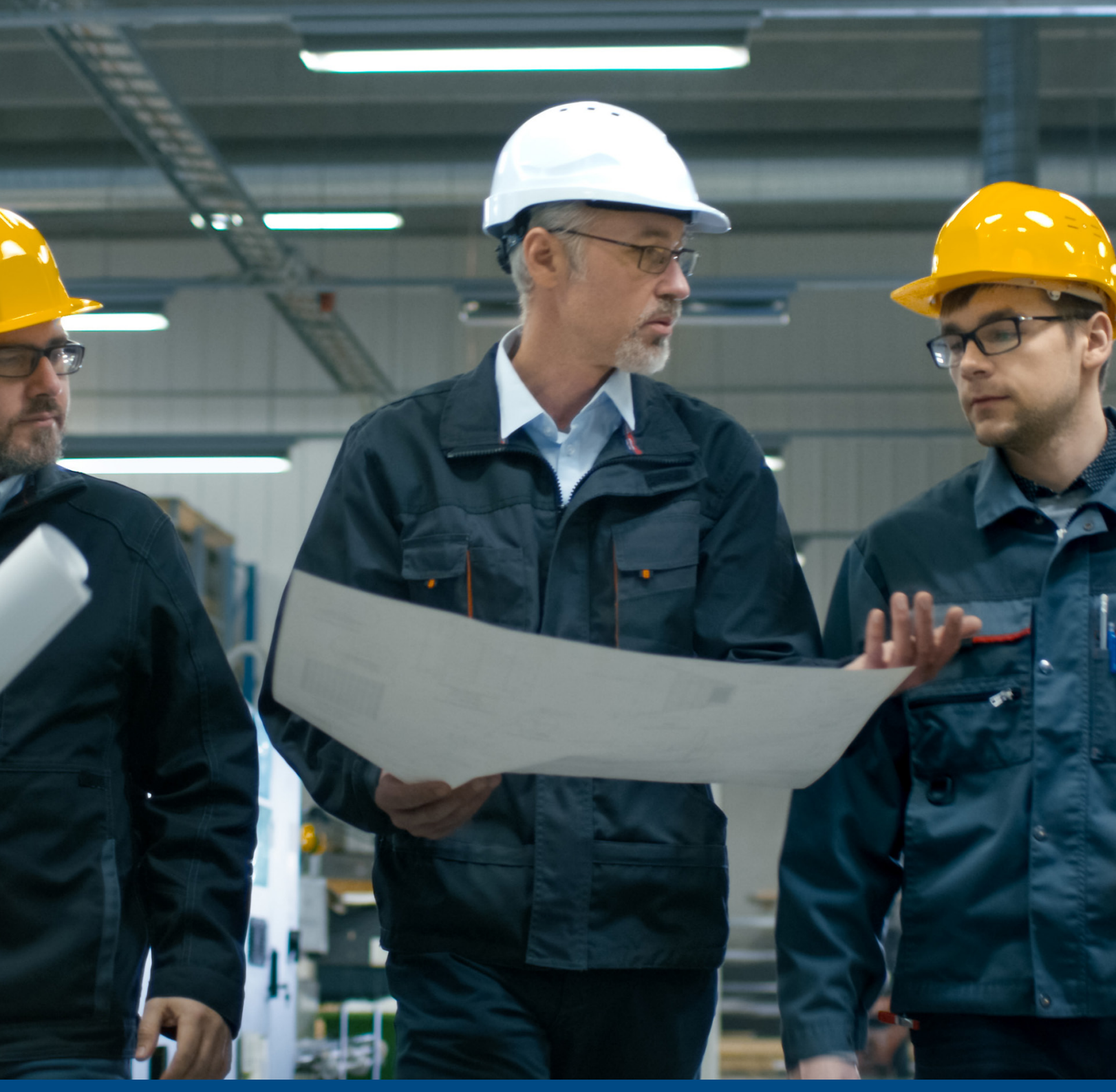
Infosys Cobalt is a set of services, solutions and platforms for enterprises to accelerate their cloud journey. It offers over 35,000 cloud assets, over 300 industry cloud solution blueprints and a thriving community of cloud business and technology practitioners to drive increased business value. With Infosys Cobalt, regulatory and security compliance, along with technical and financial governance comes baked into every solution delivered.