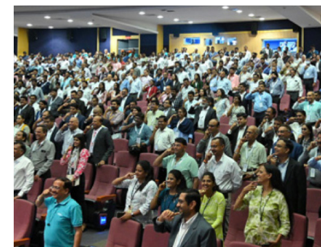
Sambandh supplier meet

Council (UNHRC), Ethical Trading Initiative (ETI) and other international frameworks. The Infosys SCoC leverages the UNGC principles including protecting and upholding internationally proclaimed human rights, treating all persons with respect and dignity while safeguarding their rights, the elimination of forced and compulsory labor, the abolition of child labor in the supply chain and strong corporate governance practices including anti-corruption and anti-bribery and promoting fair business practices across the supply chain. During the assessment no actual and potential negative environmental and social impact was identified in the supply chain.