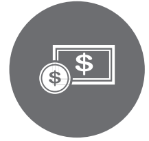
CRM & Loyalty

In line with these market needs, Infosys Digital Marketing offerings include: