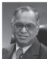
N. R. Narayana Murthy