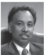
S. D. Shibulal

S. Gopalakrishnan holds 66,56,726 equity shares of the Company.