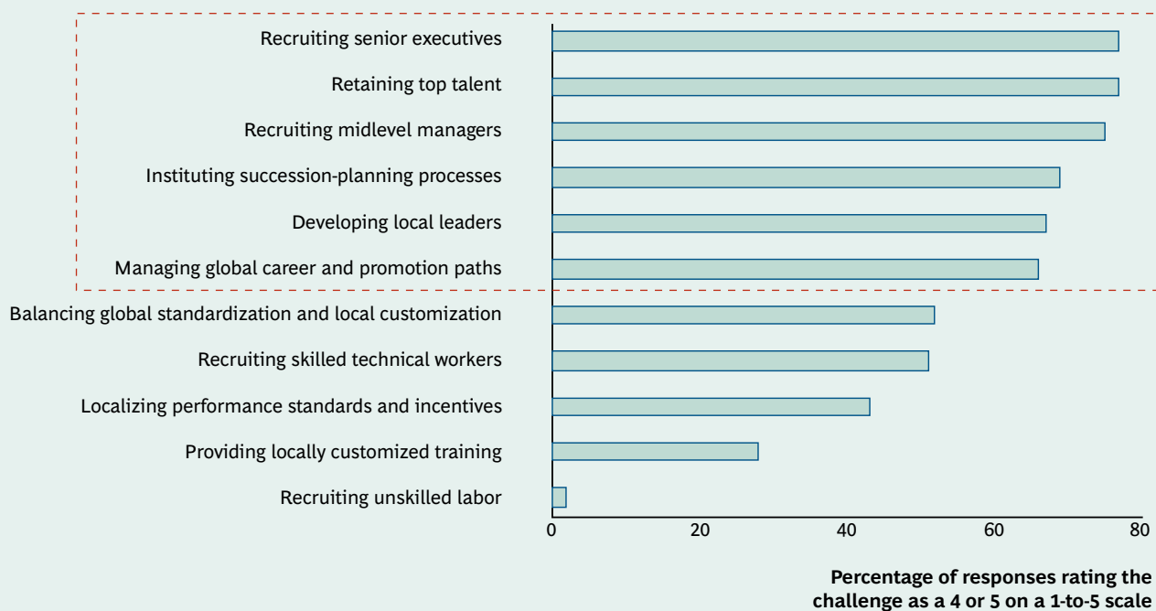
Exhibit 3. Recruiting, Retaining, and Developing Talent in RDEs Are Top Challenges for Global Companies

Source: BCG 2007 Aligning Talent for Global Advantage Survey.