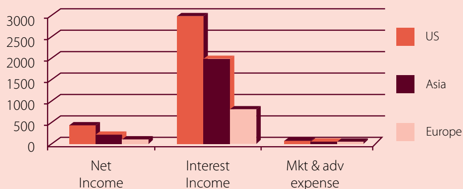
1. Geography-wise income and expense

Which are my highly profitable customers?