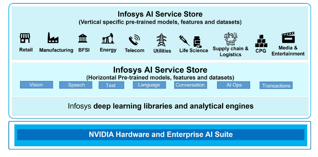
Figure 2: Infosys Applied AI Services Stack

Exclusive access to NVIDIA's accelerated computing infrastructure, advanced AI servers, and accelerated AI frameworks empower Infosys to boost domain expertise and expand its AI capabilities through research and development. This collaboration also allows us to create AI-driven service stores that focus on delivering business outcomes for our enterprise clients (Figure 2).