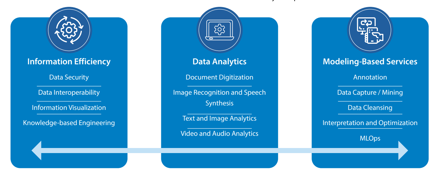
Figure 1: Infosys Cognitive Data Services

The Infosys AI on Edge Framework is a powerful tool enabling businesses to leverage the power of AI algorithms on edge devices. We adhere to industry standards for responsible AI, and process diverse types of data and real-time data feeds for AI-driven data management (Figure 1) enabling businesses to leverage latest technologies and make informed decisions that drive growth and success in today's fast-paced business environment.